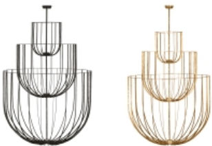
Aged Iron Polished Antique Brass